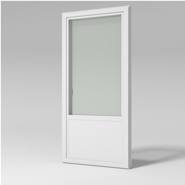
With insulated panel